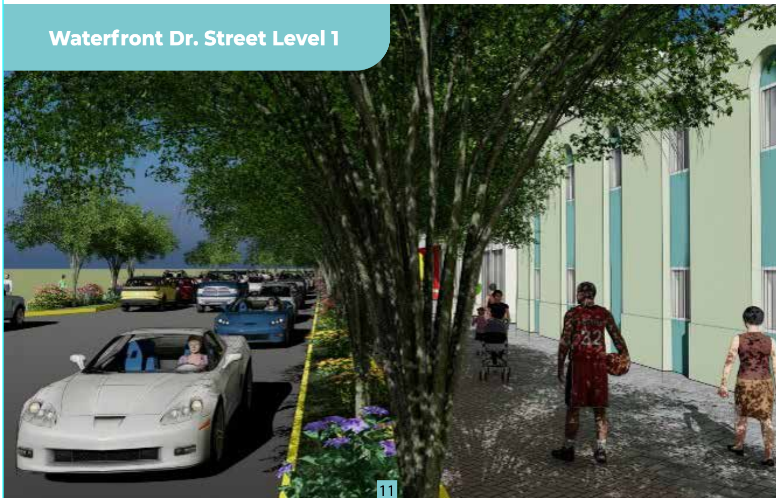
Waterfront Dr. Street Level 1