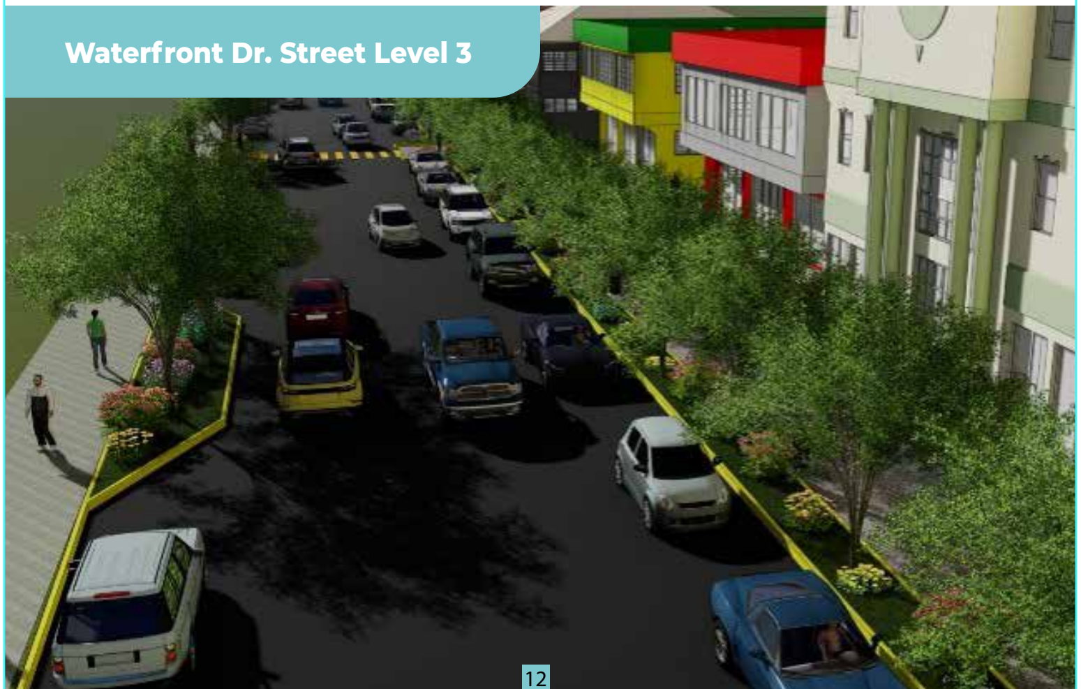
Waterfront Dr. Street Level 3