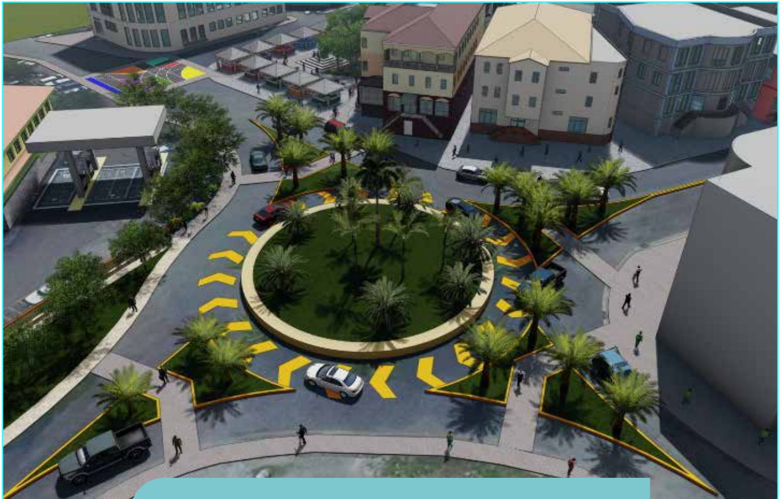
Improved Pedestrian Access at Roundabout