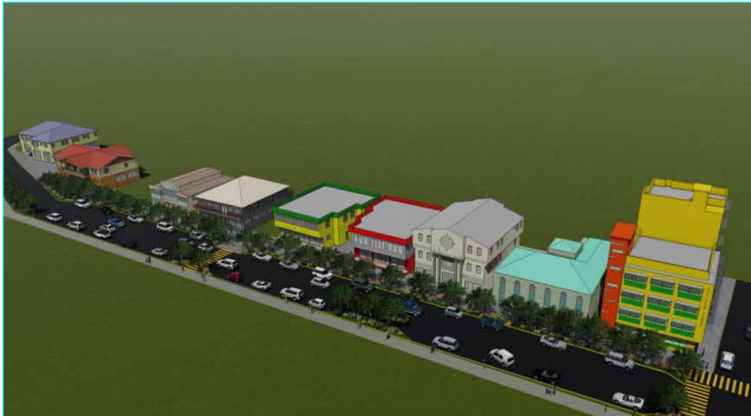
Waterfront Dr. Aerial Perspective