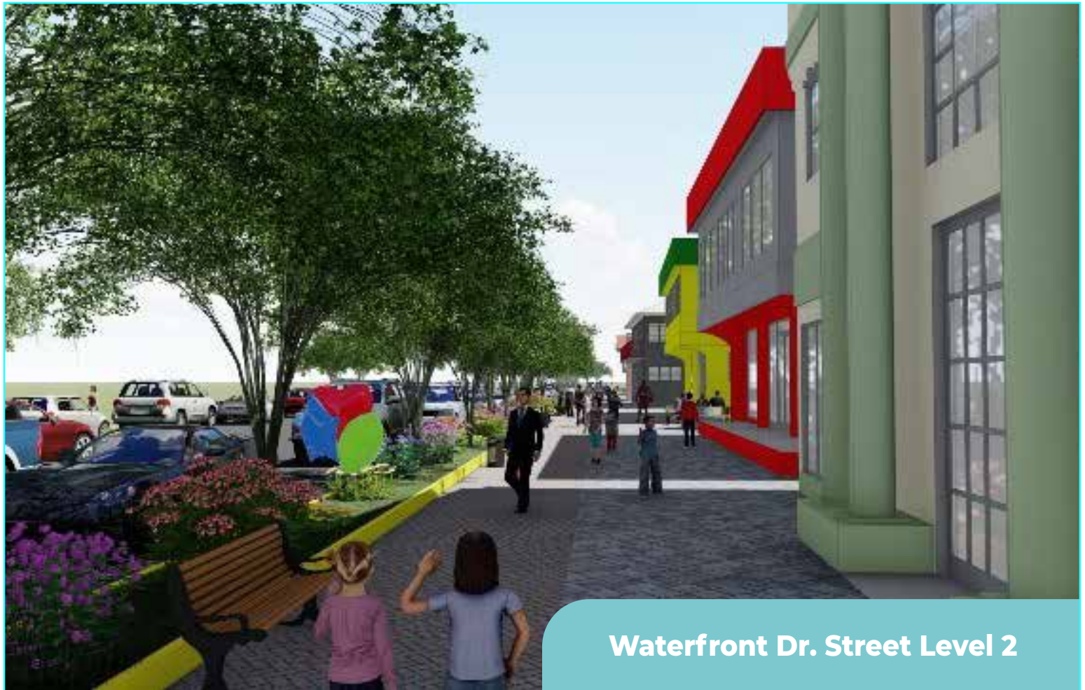
Waterfront Dr. Street Level 2